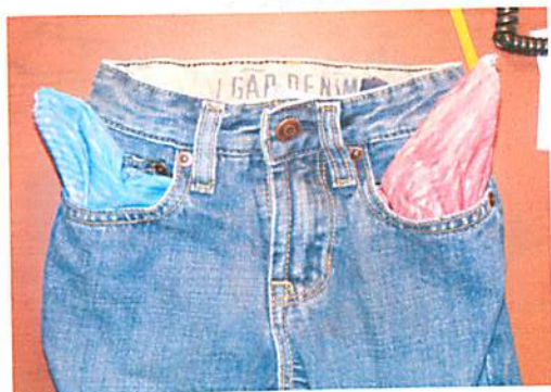
Coloring inside of pockets for 'flagging' gang colors